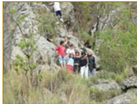
A Group With No name

I am writing this with a heavy heart and ask for you to please continue to pray about bringing forth a leader to